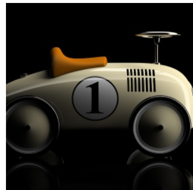
Kensington Derby & Arts Festival May 13 | 12pm-6pm

It's that time of year again! Spruce Street Harbor Park opens for Center City to enjoy riverside eats & activities.