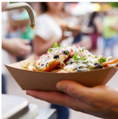
South Street Fest May 6 | 11am-7pm

This annual event is a huge outdoor party that is over seven blocks of art, fashion, food, and fun!