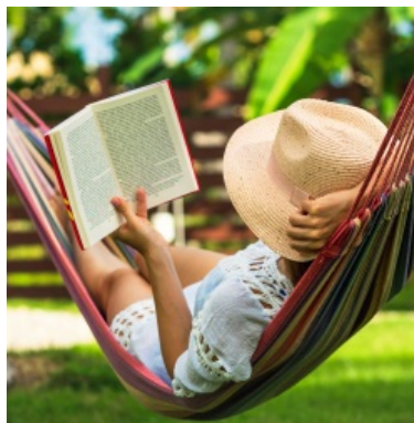
Spruce St. Harbor Park May 12-Sept. 24

This annual event is a huge outdoor party that is over seven blocks of art, fashion, food, and fun!